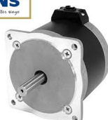
STEP MOTORS 34HY1801-03