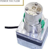
EXTERNAL GEAR PUMP FG409XD0C