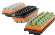
GLAZE POLISHING ABRASIVE LAPPATO - 100MM / 140MM