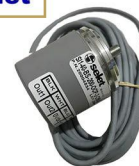
ENCODER - S11-40-BS-200- 0CP-2-C5R6