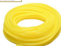
TYGON CLEAR FLEXIBLE TUBE ACF00010