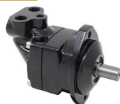
PARKER HYDRAULIC MOTOR FI1