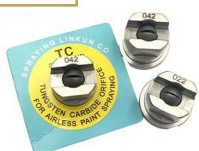
GLAZING LINE NOZZLE S-89238912