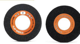
FLAP WHEEL 50x50x150