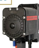
FLOJET G575205 PUMP G575205