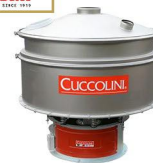
C-LINE TRADITIONAL VIBRATING SIEVES - VP SERIES