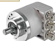
HENGSTLER ROTARY ENCODER AC58