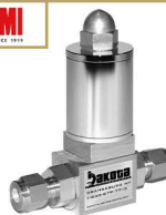
PROPORTIONAL VALVE D SERIES