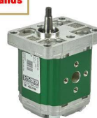
HYDRAULIC PUMPS XIP2702FIIA