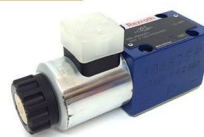
DIRECTIONAL CONTROL VALVE R901020360