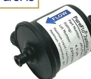
CAPSULE FILTER 2.5" SKLDP100S2QP2QP-BLK-OV